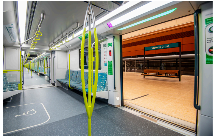
Train testing at Victoria Cross Station.