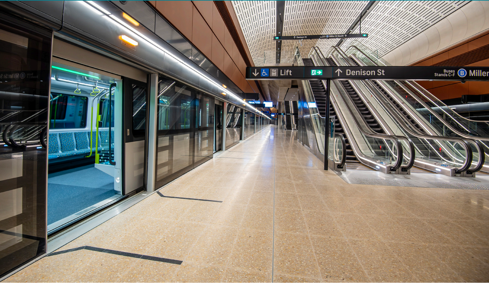
Victoria Cross Station platform.