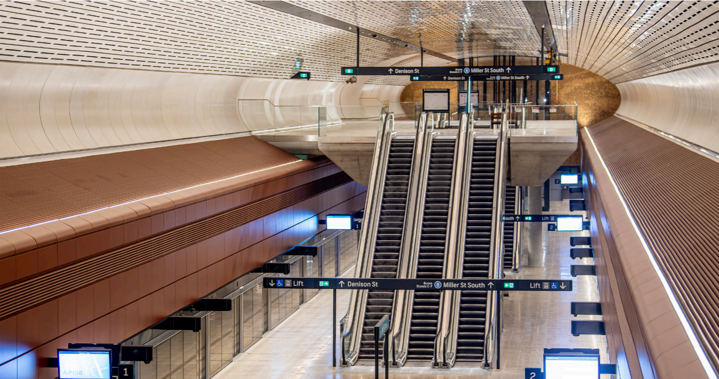
Images of the Victoria Cross Station platform and pedestrian access.