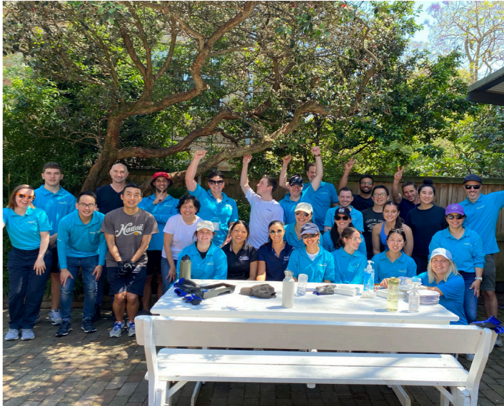
Victoria Cross project team.

It was not only a day of transformation for the shelter but also a milestone in the ongoing commitment to community welfare and sustained collaboration between Lendlease and Taldumande over the course of the project.