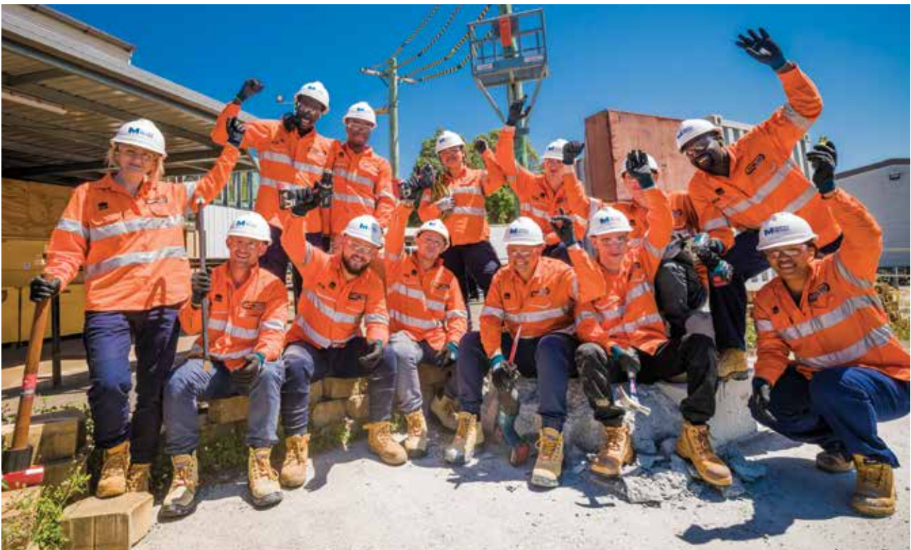
Sydney Metro Pre-employment program participants.