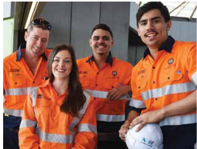
Top: Sydney Metro Pre-employment program participant.