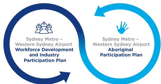
Figure 2: Alignment between the Western Sydney Airport Workforce Development and Industry plan and Western Sydney Airport Aboriginal Participation plan.

Sydney Metro will continue to incorporate lessons learnt and work with our delivery partners and wider industry to meet or exceed the key deliverables of the Aboriginal procurement policy.