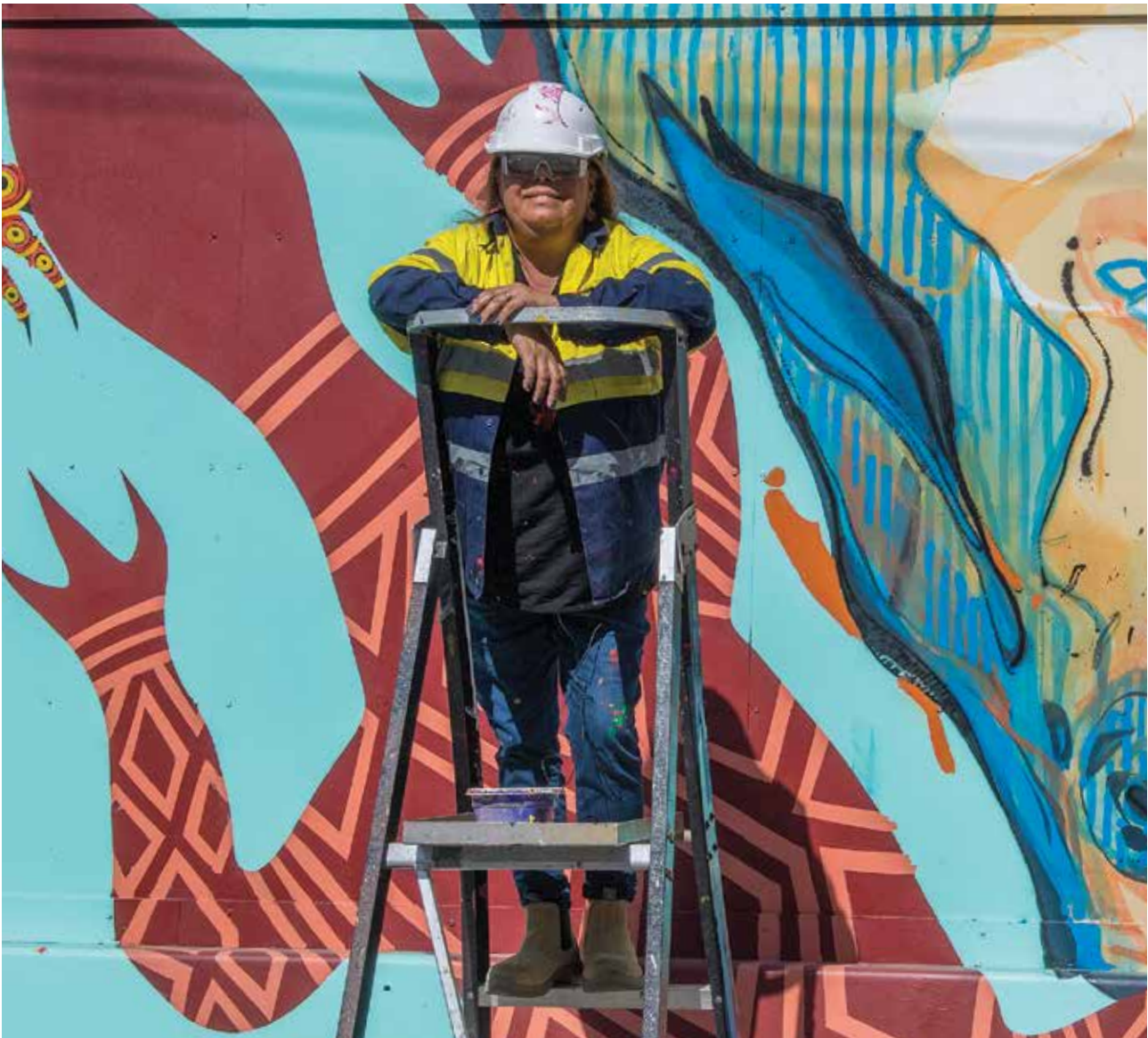
Hoarding Mural in Marrickville and artist.

The NSW Aboriginal Land Council (NSWALC) has partnered with the Australian Government, under the Indigenous Business Sector Strategy (IBSS), to design and deliver the NSW Indigenous Business and Employment Hub (the Yarpa Hub). The Yarpa Hub is a one-stop-shop for Indigenous businesses, entrepreneurs and job seekers to build relationships and connect Indigenous people to business and employment opportunities. Employers wishing to hire Indigenous Australians or engage Indigenous businesses in their supply chain will also be assisted to access the most appropriate service or advice. NSWALC will deliver the Hub in close collaboration with the Australian and NSW Governments to ensure Indigenous businesses and job seekers can get the support they need quickly and easily 5 .