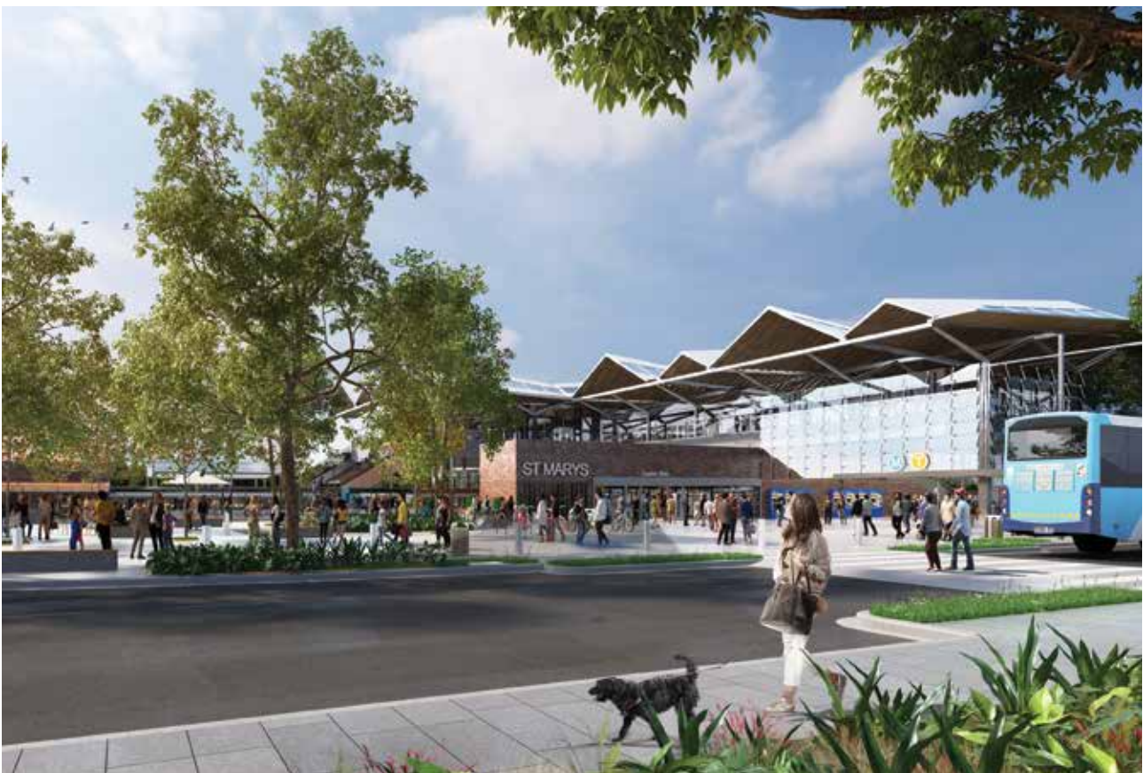
An artist's impression of St Marys Station.

Refer to priority 2, table 3 for further information on how Sydney Metro applies the Indigenous Social and local participation targets.