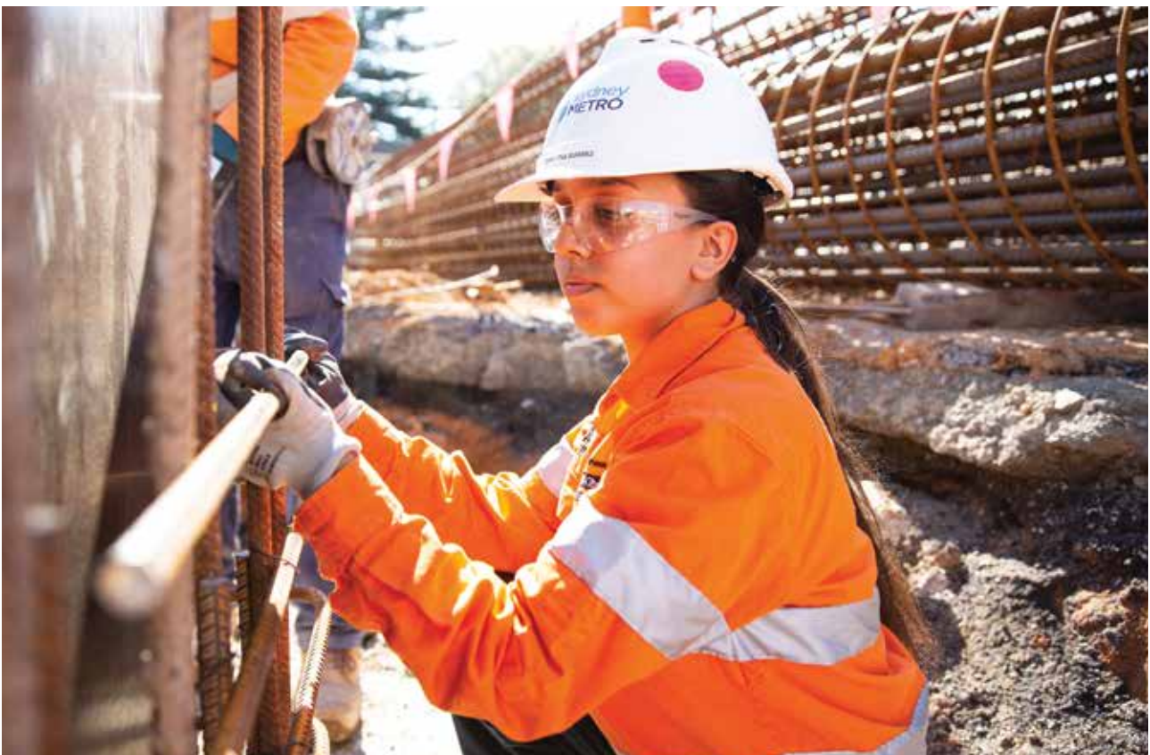
Sydney Metro school based apprentice.