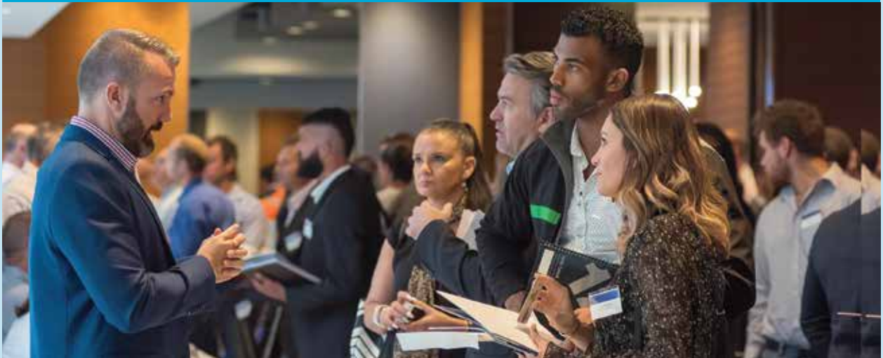
Sydney Metro Aboriginal Business Forum.

In 2016, the Sydney Metro established the Sydney Metro Aboriginal Business Forums as a mechanism to support its commitment to increase Recognised Aboriginal Businesses in the wider supply chain.