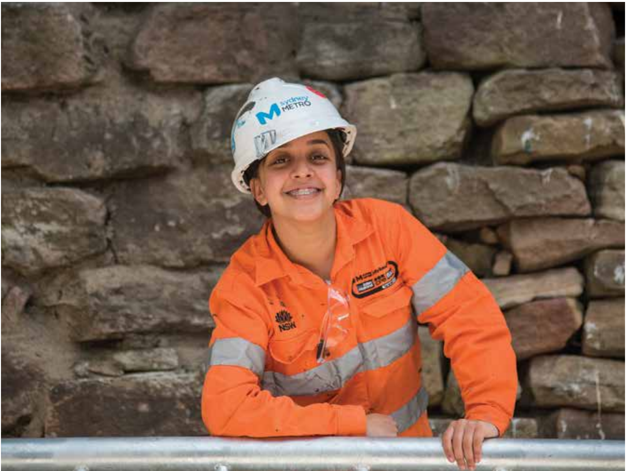
Sydney Metro school based apprentice.

Sydney Metro acknowledges the significant potential to provide employment creation through the mobilisation of this project, whilst being mindful that the overall commitment to increase career pathways will place a strain on the candidate resources due to concurrent projects of works in and around the area. It is for this reason that investment into the development of future talent be explored through a number of entry level options.