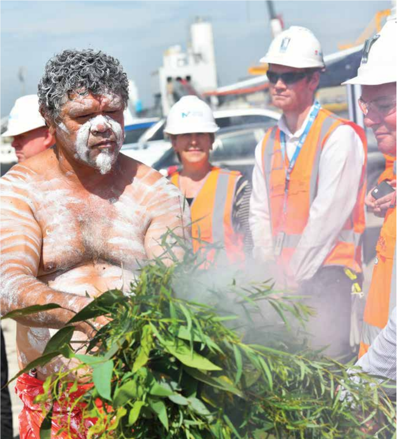
Smoking ceremony at Marrickville TBM launch.

Through the engagement of Aboriginal owned businesses within the supply chain and the increase in Aboriginal jobs creation, Sydney Metro has the opportunity to contribute to closing the gaps between Indigenous and non-Indigenous peoples in a variety of areas.