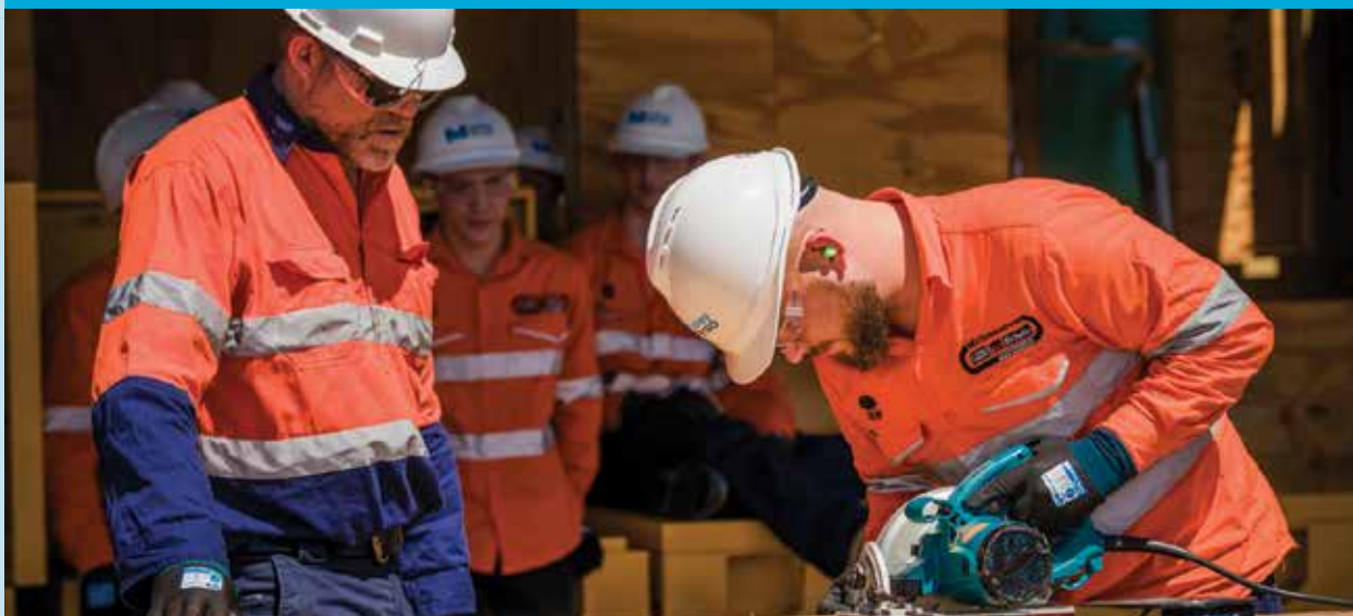
Sydney Metro Pre-employment program participants.

Sydney Metro's Pre-employment Program helps local and long-term unemployed people find jobs on major transport infrastructure projects. Launched in November 2014, it was awarded the 2015 NSW Premier's Award in the category 'Making NSW a better place to live'. The program provides tailored technical training and employability skills, instilling confidence and increasing communication and team working skills. Training is aligned to specific job roles and existing vacancies with Sydney Metro's contractor partners.