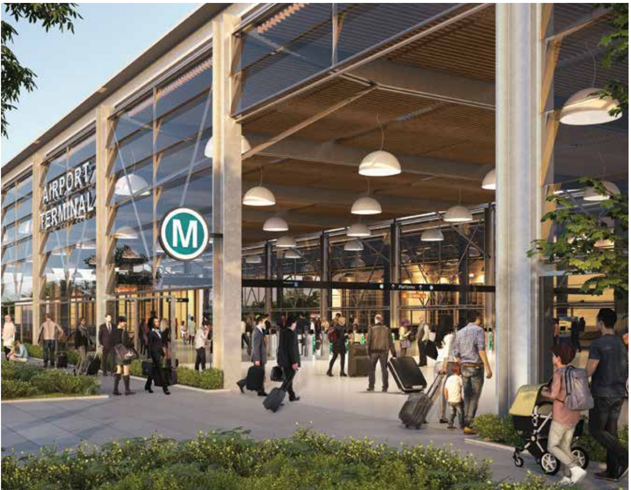
An artist's impression of Airport Terminal Station.