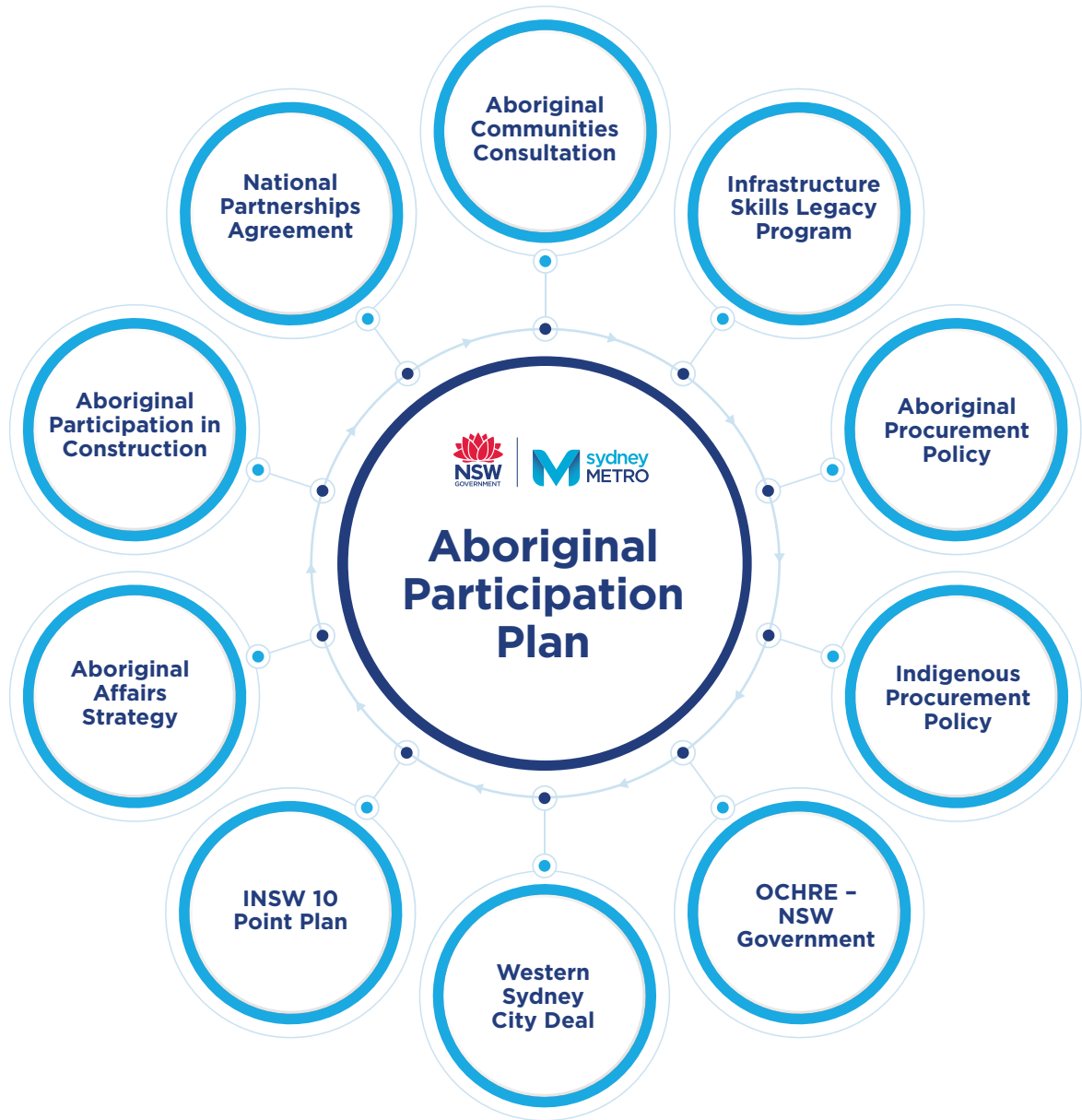
Figure 1: Wider government plans, priorities and policies that align to the Sydney Metro - Western Sydney Airport Aboriginal Participation plan