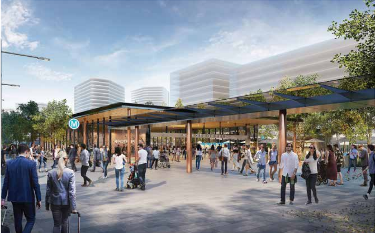
An artist's impression of Aerotropolis Station.